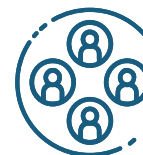
TAB. 1 - RECOMMENDATIONS FOR A PUBLIC POLICY SOLUTION WITH AN EMPHASIS ON VULNERABLE AND MARGINALISED POPULATIONS